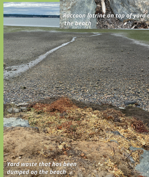
Yard waste that has been dumped on the beach