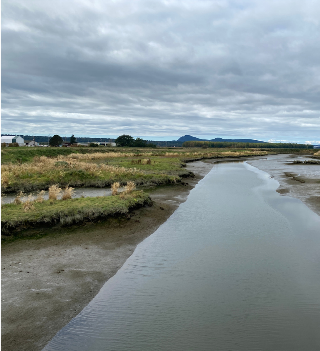
Big Indian Slough, shortly before it flows into Padilla Bay