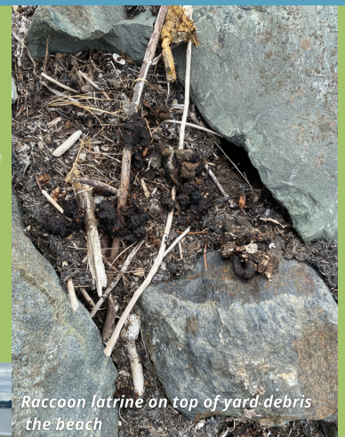
Raccoon latrine on top of yard debris the beach